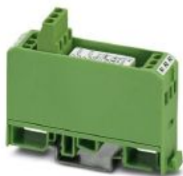
Relay module, with soldered-in miniature switching relay, contact (AgNi+Au): Small to large loads, 2 PDT, 24 V AC/DC input voltage

Please be informed that the data shown in this PDF Document is generated from our Online Catalog. Please find the complete data in the user's documentation. Our General Terms of Use for Downloads are valid ( http://phoenixcontact.com/download )