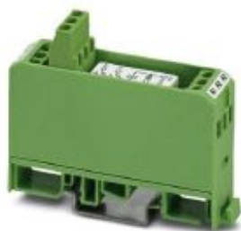
Relay module, with soldered-in miniature switching relay, contact (AgNi+Au): Small to large loads, 2 PDT, 230 V AC input voltage

Please be informed that the data shown in this PDF Document is generated from our Online Catalog. Please find the complete data in the user's documentation. Our General Terms of Use for Downloads are valid ( http://phoenixcontact.com/download )