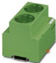
Rail-mountable double socket, with glow lamp, green housing

Please be informed that the data shown in this PDF Document is generated from our Online Catalog. Please find the complete data in the user's documentation. Our General Terms of Use for Downloads are valid ( http://phoenixcontact.com/download )