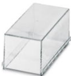
Covering hood, for the contact and dust-protected encapsulation of the components, in transparent design. Height: 35 mm, width: 100 mm

Please be informed that the data shown in this PDF Document is generated from our Online Catalog. Please find the complete data in the user's documentation. Our General Terms of Use for Downloads are valid ( http://phoenixcontact.com/download )