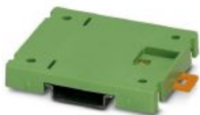
The figure shows version EM-MP 45 N

Mounting plate, for screwing on siz 0 switchgear