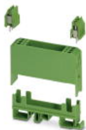
Electronic housing set, consisting of electronic housing and printed circuit termination blocks, pitch 5

Please be informed that the data shown in this PDF Document is generated from our Online Catalog. Please find the complete data in the user's documentation. Our General Terms of Use for Downloads are valid ( http://phoenixcontact.com/download )