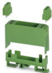
Electronic housing set, consisting of electronic housing and printed circuit termination blocks, pitch 5

Please be informed that the data shown in this PDF Document is generated from our Online Catalog. Please find the complete data in the user's documentation. Our General Terms of Use for Downloads are valid ( http://phoenixcontact.com/download )