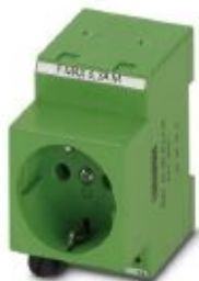
Rail-mountable socket, with glow lamp and equipment fusing 5x 20 mm to max. 6.3 A; green housing

Please be informed that the data shown in this PDF Document is generated from our Online Catalog. Please find the complete data in the user's documentation. Our General Terms of Use for Downloads are valid ( http://phoenixcontact.com/download )