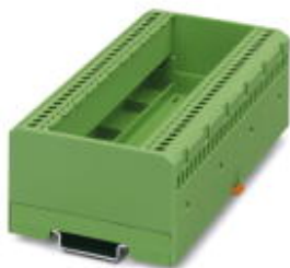
Electronic housing, for PCB insertion, without screw connection terminal blocks and cover

Please be informed that the data shown in this PDF Document is generated from our Online Catalog. Please find the complete data in the user's documentation. Our General Terms of Use for Downloads are valid ( http://phoenixcontact.com/download )