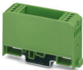
Electronic housing, with universal foot, for PCB insertion, without screw connection terminal blocks and cover

Please be informed that the data shown in this PDF Document is generated from our Online Catalog. Please find the complete data in the user's documentation. Our General Terms of Use for Downloads are valid ( http://phoenixcontact.com/download )