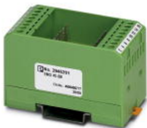
Custom circuit module, consisting of housing, MKDS 3 connection terminal blocks and PCB

Please be informed that the data shown in this PDF Document is generated from our Online Catalog. Please find the complete data in the user's documentation. Our General Terms of Use for Downloads are valid ( http://phoenixcontact.com/download )