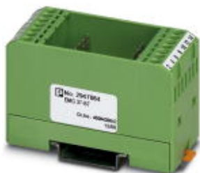
Custom circuit module, consisting of housing, MKDS 3 connection terminal blocks and PCB

Please be informed that the data shown in this PDF Document is generated from our Online Catalog. Please find the complete data in the user's documentation. Our General Terms of Use for Downloads are valid ( http://phoenixcontact.com/download )