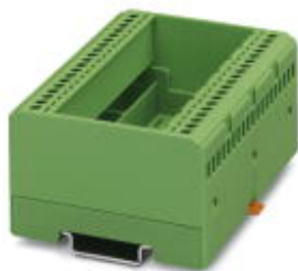
Electronic housing, for PCB insertion, without screw connection terminal blocks and cover

Please be informed that the data shown in this PDF Document is generated from our Online Catalog. Please find the complete data in the user's documentation. Our General Terms of Use for Downloads are valid ( http://phoenixcontact.com/download )