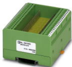
Custom circuit module, consisting of housing, MKDS 3 connection terminal blocks and PCB

Please be informed that the data shown in this PDF Document is generated from our Online Catalog. Please find the complete data in the user's documentation. Our General Terms of Use for Downloads are valid ( http://phoenixcontact.com/download )