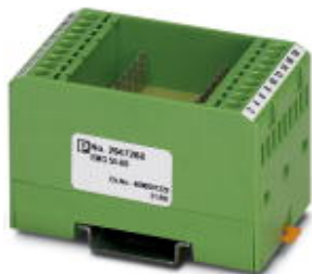
Custom circuit module, consisting of housing, MKDS 3 connection terminal blocks and PCB

Please be informed that the data shown in this PDF Document is generated from our Online Catalog. Please find the complete data in the user's documentation. Our General Terms of Use for Downloads are valid ( http://phoenixcontact.com/download )