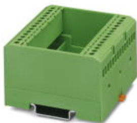
Electronic housing, for PCB insertion, without screw connection terminal blocks and cover

Please be informed that the data shown in this PDF Document is generated from our Online Catalog. Please find the complete data in the user's documentation. Our General Terms of Use for Downloads are valid ( http://phoenixcontact.com/download )