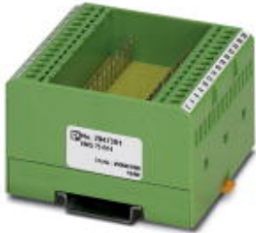
Custom circuit module, consisting of housing, MKDS 3 connection terminal blocks and PCB

Please be informed that the data shown in this PDF Document is generated from our Online Catalog. Please find the complete data in the user's documentation. Our General Terms of Use for Downloads are valid ( http://phoenixcontact.com/download )