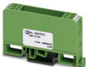
Custom circuit module, consisting of housing, MKDS 3 connection terminal blocks and PCB

Please be informed that the data shown in this PDF Document is generated from our Online Catalog. Please find the complete data in the user's documentation. Our General Terms of Use for Downloads are valid ( http://phoenixcontact.com/download )