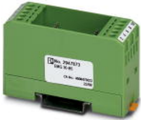
Custom circuit module, consisting of housing, MKDS 3 connection terminal blocks and PCB

Please be informed that the data shown in this PDF Document is generated from our Online Catalog. Please find the complete data in the user's documentation. Our General Terms of Use for Downloads are valid ( http://phoenixcontact.com/download )