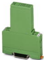
Motor attenuation module, for star-connected three-phase motors. Power range 4 kW

Please be informed that the data shown in this PDF Document is generated from our Online Catalog. Please find the complete data in the user's documentation. Our General Terms of Use for Downloads are valid ( http://phoenixcontact.com/download )