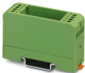
Electronic housing, with snap foot for DIN rail EN 50022 for PCB insertion, without screw connection terminal blocks and cover

Please be informed that the data shown in this PDF Document is generated from our Online Catalog. Please find the complete data in the user's documentation. Our General Terms of Use for Downloads are valid ( http://phoenixcontact.com/download )