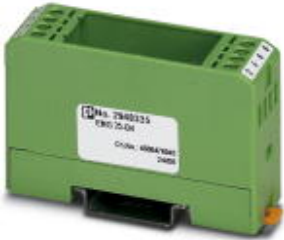
Custom circuit module, consisting of housing, MKDS 3 connection terminal blocks and PCB

Please be informed that the data shown in this PDF Document is generated from our Online Catalog. Please find the complete data in the user's documentation. Our General Terms of Use for Downloads are valid ( http://phoenixcontact.com/download )