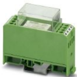
Relay module, with soldered-in miniature switching relay, contact (AgNi+Au): Small to large loads, 1 PDT, 230 V AC/DC input voltage

Please be informed that the data shown in this PDF Document is generated from our Online Catalog. Please find the complete data in the user's documentation. Our General Terms of Use for Downloads are valid ( http://phoenixcontact.com/download )