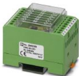
Diode module, with eight diodes, can be individually wired, diode type 1N 5408

Please be informed that the data shown in this PDF Document is generated from our Online Catalog. Please find the complete data in the user's documentation. Our General Terms of Use for Downloads are valid ( http://phoenixcontact.com/download )