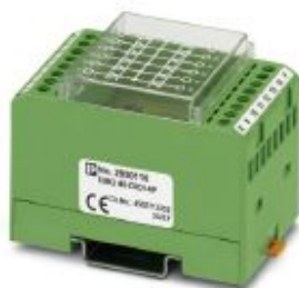
Diode module, for extension with 14 1N 4007 diodes, with a common cathode

Please be informed that the data shown in this PDF Document is generated from our Online Catalog. Please find the complete data in the user's documentation. Our General Terms of Use for Downloads are valid ( http://phoenixcontact.com/download )