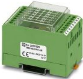
Diode module, with 14 diodes, common anode, diode type 1N 4007

Please be informed that the data shown in this PDF Document is generated from our Online Catalog. Please find the complete data in the user's documentation. Our General Terms of Use for Downloads are valid ( http://phoenixcontact.com/download )