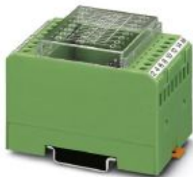
Lamp test module, 2 diodes with common cathode: with 7 pairs, with common triggering

Please be informed that the data shown in this PDF Document is generated from our Online Catalog. Please find the complete data in the user's documentation. Our General Terms of Use for Downloads are valid ( http://phoenixcontact.com/download )