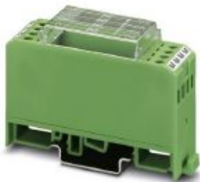
Diode module, with four diodes, common anode, diode type 1N 5408

Please be informed that the data shown in this PDF Document is generated from our Online Catalog. Please find the complete data in the user's documentation. Our General Terms of Use for Downloads are valid ( http://phoenixcontact.com/download )