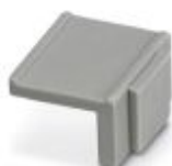
Device marking label, width: 12 mm, area: 12 x 8 mm, e.g. for EML(10x7) R adhesive marking material