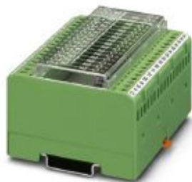
Lamp test module, 2 diodes with common cathode: with 16 pairs, with common triggering

Please be informed that the data shown in this PDF Document is generated from our Online Catalog. Please find the complete data in the user's documentation. Our General Terms of Use for Downloads are valid ( http://phoenixcontact.com/download )