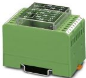
Lamp test module, 2 diodes with common cathode: with 4 pairs, for individual wiring

Please be informed that the data shown in this PDF Document is generated from our Online Catalog. Please find the complete data in the user's documentation. Our General Terms of Use for Downloads are valid ( http://phoenixcontact.com/download )