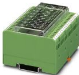
Lamp test module, 2 diodes with common cathode: with 8 pairs, for individual wiring

Please be informed that the data shown in this PDF Document is generated from our Online Catalog. Please find the complete data in the user's documentation. Our General Terms of Use for Downloads are valid ( http://phoenixcontact.com/download )