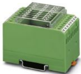
Diode module, with eight diodes, common anode, diode type 1N 5408

Please be informed that the data shown in this PDF Document is generated from our Online Catalog. Please find the complete data in the user's documentation. Our General Terms of Use for Downloads are valid ( http://phoenixcontact.com/download )