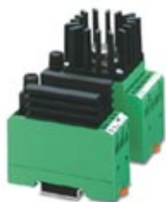
Voltage regulator module with fixed-voltage regulator, input 16 V-21 V AC/19 V-30 V DC, output 12 V DC/1 A

Please be informed that the data shown in this PDF Document is generated from our Online Catalog. Please find the complete data in the user's documentation. Our General Terms of Use for Downloads are valid ( http://phoenixcontact.com/download )