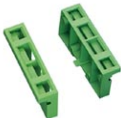
Side element, with marker groove, labeling with SS-ZB. Width: 11 mm, length: 45 mm, height: 21 mm

Please be informed that the data shown in this PDF Document is generated from our Online Catalog. Please find the complete data in the user's documentation. Our General Terms of Use for Downloads are valid ( http://phoenixcontact.com/download )