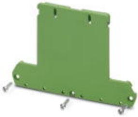
Side element, without foot, tall version, for 73 mm wide U-shaped cover.

Please be informed that the data shown in this PDF Document is generated from our Online Catalog. Please find the complete data in the user's documentation. Our General Terms of Use for Downloads are valid ( http://phoenixcontact.com/download )