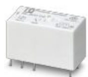
Plug-in miniature power relay, with power contact for high continuous currents, 1 PDT, input voltage 24 V DC

Single relay - REL-MR- 24DC/21HC - 2961312