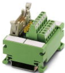
VARIOFACE COMPACT LINE, interface module for 8 channels, with LED, for assembly on DIN rail NS 35/7.5, screw connection

Please be informed that the data shown in this PDF Document is generated from our Online Catalog. Please find the complete data in the user's documentation. Our General Terms of Use for Downloads are valid ( http://phoenixcontact.com/download )