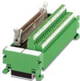
VARIOFACE COMPACT LINE, interface module for 32 channels, with LED, for assembly on DIN rail NS 35/7.5, screw connection

Please be informed that the data shown in this PDF Document is generated from our Online Catalog. Please find the complete data in the user's documentation. Our General Terms of Use for Downloads are valid ( http://phoenixcontact.com/download )