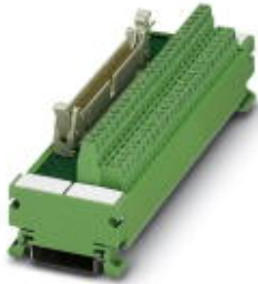
VARIOFACE module, with screw connection and flat-ribbon cable connector, for assembly on NS 35/7.5, 14 positions

Please be informed that the data shown in this PDF Document is generated from our Online Catalog. Please find the complete data in the user's documentation. Our General Terms of Use for Downloads are valid ( http://phoenixcontact.com/download )