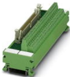
VARIOFACE module, with screw connection and flat-ribbon cable connector, for assembly on NS 35/7.5, 16 positions

Please be informed that the data shown in this PDF Document is generated from our Online Catalog. Please find the complete data in the user's documentation. Our General Terms of Use for Downloads are valid ( http://phoenixcontact.com/download )