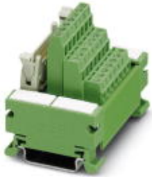
VARIOFACE module, with screw connection and flat-ribbon cable connector, for assembly on NS 35/7.5, 20 positions

Please be informed that the data shown in this PDF Document is generated from our Online Catalog. Please find the complete data in the user's documentation. Our General Terms of Use for Downloads are valid ( http://phoenixcontact.com/download )