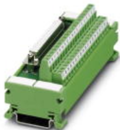
VARIOFACE module, with screw connection and D-subminiature socket strip, for assembly on NS 35/7.5, 37 positions

Please be informed that the data shown in this PDF Document is generated from our Online Catalog. Please find the complete data in the user's documentation. Our General Terms of Use for Downloads are valid ( http://phoenixcontact.com/download )