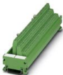
VARIOFACE COMPACT LINE, sensor module for the connection of 32 p-n-p sensors, for assembly on DIN rail NS 35/7.5, screw connection

Please be informed that the data shown in this PDF Document is generated from our Online Catalog. Please find the complete data in the user's documentation. Our General Terms of Use for Downloads are valid ( http://phoenixcontact.com/download )