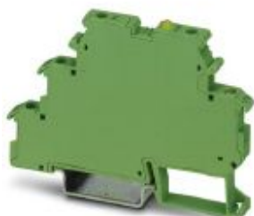
Power solid-state relay terminal block for actuator, input: 24 V DC, output: 3 - 30 V DC/3 A, terminal block width: 6.2 mm

Please be informed that the data shown in this PDF Document is generated from our Online Catalog. Please find the complete data in the user's documentation. Our General Terms of Use for Downloads are valid ( http://phoenixcontact.com/download )