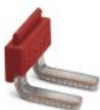
Insertion bridge, pitch: 6.15 mm, number of positions: 2, color: red

Insertion bridge - EB 2- DIK RD - 2716693