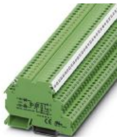
Power solid-state relay terminal block, input: 24 V DC, output: 10 - 253 V AC/800 mA, terminal block width: 6.2 mm

Please be informed that the data shown in this PDF Document is generated from our Online Catalog. Please find the complete data in the user's documentation. Our General Terms of Use for Downloads are valid ( http://phoenixcontact.com/download )