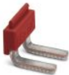
Insertion bridge, pitch: 6.15 mm, number of positions: 2, color: red

Insertion bridge - EB 2- DIK RD - 2716693