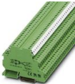
Solid-state relay interface designed to prevent interference on the control side, input: 230 V AC, output: 48 V DC/100 mA

Please be informed that the data shown in this PDF Document is generated from our Online Catalog. Please find the complete data in the user's documentation. Our General Terms of Use for Downloads are valid ( http://phoenixcontact.com/download )