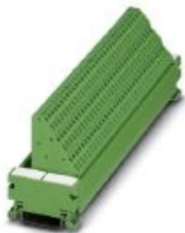
VARIOFACE COMPACT LINE, sensor module for the connection of 32 p-n-p sensors, for assembly on DIN rail NS 35/7.5, spring-cage connection

Please be informed that the data shown in this PDF Document is generated from our Online Catalog. Please find the complete data in the user's documentation. Our General Terms of Use for Downloads are valid ( http://phoenixcontact.com/download )