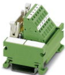
VARIOFACE COMPACT LINE, interface module for 8 channels, with LED, for assembly on DIN rail NS 35/7.5, spring-cage connection

Please be informed that the data shown in this PDF Document is generated from our Online Catalog. Please find the complete data in the user's documentation. Our General Terms of Use for Downloads are valid ( http://phoenixcontact.com/download )