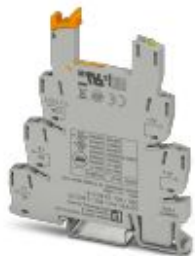
6.2 mm PLC basic terminal block with screw connection, without relays or solid-state relay, for mounting on DIN rail NS 35/7,5, 1 PDT, input voltage 24 V DC

Please be informed that the data shown in this PDF Document is generated from our Online Catalog. Please find the complete data in the user's documentation. Our General Terms of Use for Downloads are valid ( http://phoenixcontact.com/download )