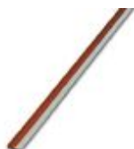
Continuous plug-in bridge, length: 500 mm, color: red

Continuous plug-in bridge - FBST 500-PLC RD - 2966786